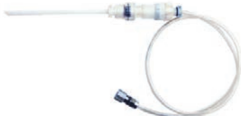
Sampling probe (with water trap function)